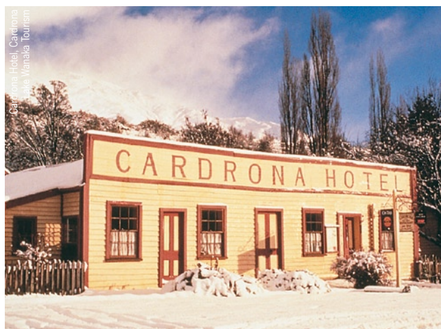
Cardrona Hotel, Cardrona Lake Wanaka Tourism