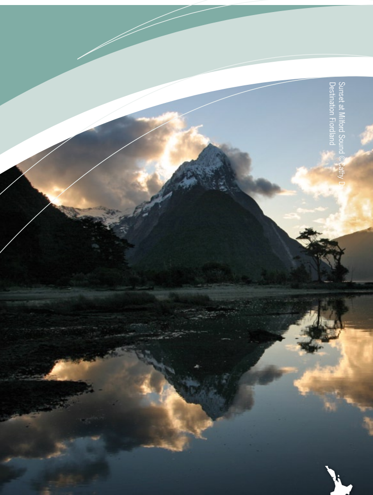
Sunset at Milford Sound